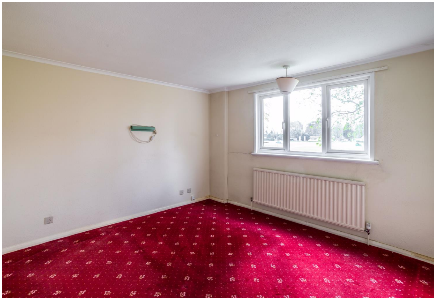
Bedroom 1 13' 6" x 12' 4" (4.11m x 3.76m) Front aspect, built in wardrobes.